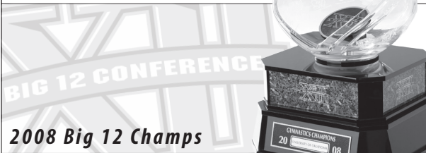
2008 Big 12 Champs

Tickets are available through the Alabama Ticket Office (205) 348-2262, located in the lobby of Coleman coliseum or online at RollTide.com.