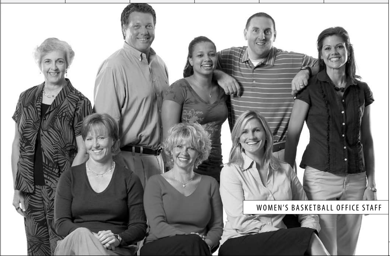
WOMEN'S BASKETBALL OFFICE STAFF