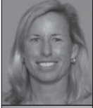
PATTY GASSO Softball - 15th year