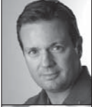
BOB STOOPS Football - 11th year