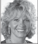
SHERRI COALE Women's Basketball - 13th year